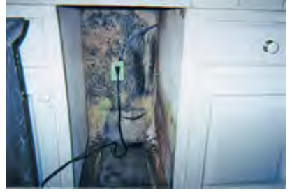
The Ballard home in Texas